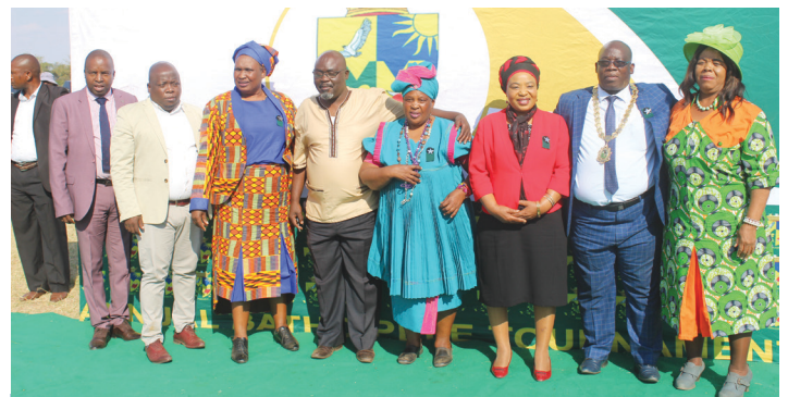
Leadership and management share a moment after the successful IDP/Budget adoption event.