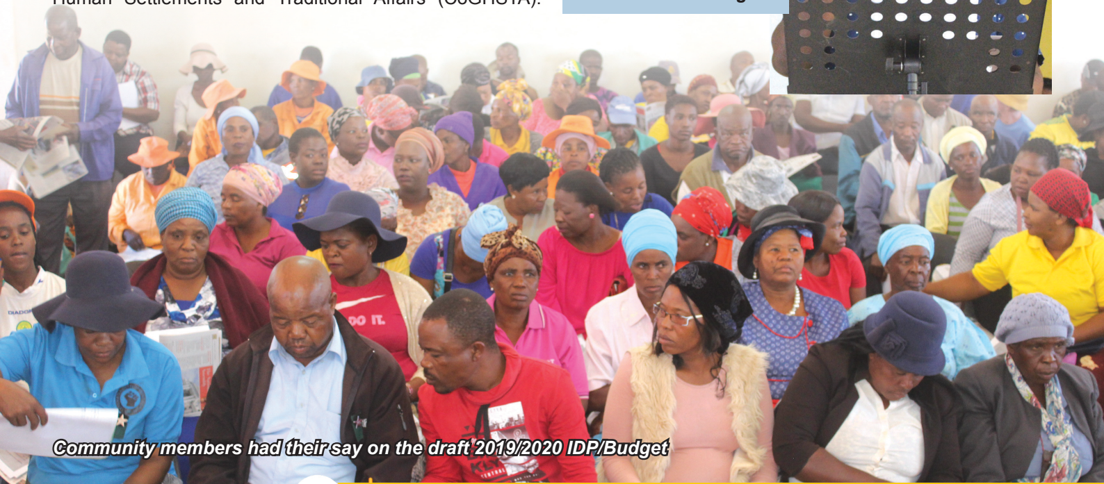
Community members had their say on the draft 2019/2020 IDP/Budget