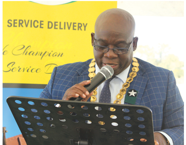
Mayor Pheedi delivering the 2019/2020 budget speech.

The other slice of the budget has been allocated to community safety and traffic services, institutional transformation and development programme sport arts and cultural programmes, special focus programmes and free basic services.