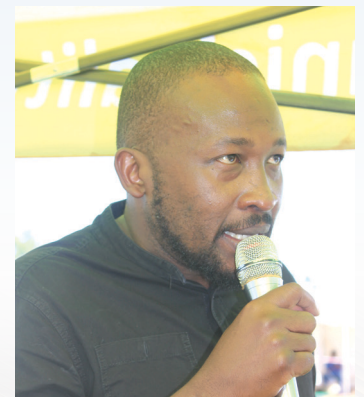
Skeem Saam actor Putla Sehlapelo sharing useful information with the learners.